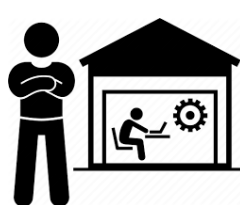
Start-up Ventures Supported