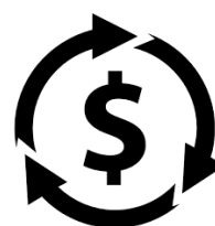
Investment/Funding Raised by Ventures