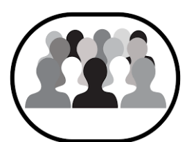
Entrepreneurship Workshops Hosted