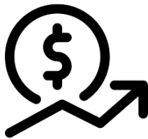
Value of Agreements