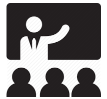
KMb Workshops Delivered