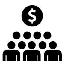
Commercialization Grant Funding