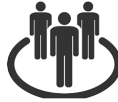
Community Projects Brokered